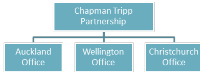
Figure 2: Organisational structure showing business units included and excluded

The boundary for preparation of Chapman Tripp's GHG inventory is for its three offices. All business activities have been included.